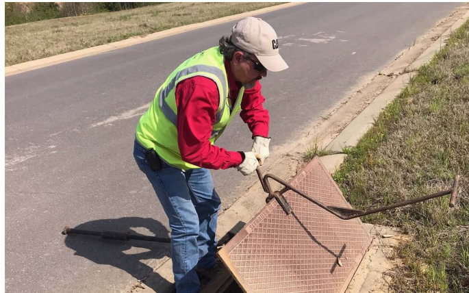
LA 2019 Winner: Ouachita's Catch Basin Lid Assist Tool

Pioneer - A locally relevant product or tool that is among the first to solve a maintenance problem with a homegrown solution.